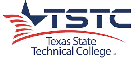
EXHIBIT A TSTC PATHWAY OFFERING FORM

In the spaces below, please indicate the pathways _____ High School proposes to offer for the 2021-22 Academic Year. Please note: The pathway proposal will initiate the development of an annual Memorandum of Understanding (MOU) but does not substitute as an agreement.